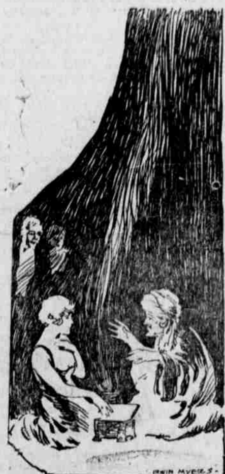
"Did I Not Say That There Was Power in the Box?" He Said Drummond.

Slowly he backed toward the window, unperceived in the general excitement; and Hugh dodged rapidly toward the car. It struck him that the scene was over, and he just had time to see Lakington snatch something which appeared to have been let down by a string from above, before turning into the bushes and re-