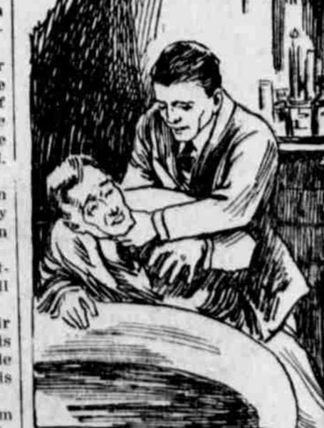
But Still There Was No Mercy on the Soldier's Face, and He Felt Himself Being Forced Farther and Farther Over the Liquid.

of us two ceases to adorn the earth; that is, if your diagnosis of the contents of the bath is correct. What little gleam of pity I might have possessed for you has been completely extinguished by your present exhibition of nauseating cowardice. Fight, you worm, fight; or I'll throw you in!"