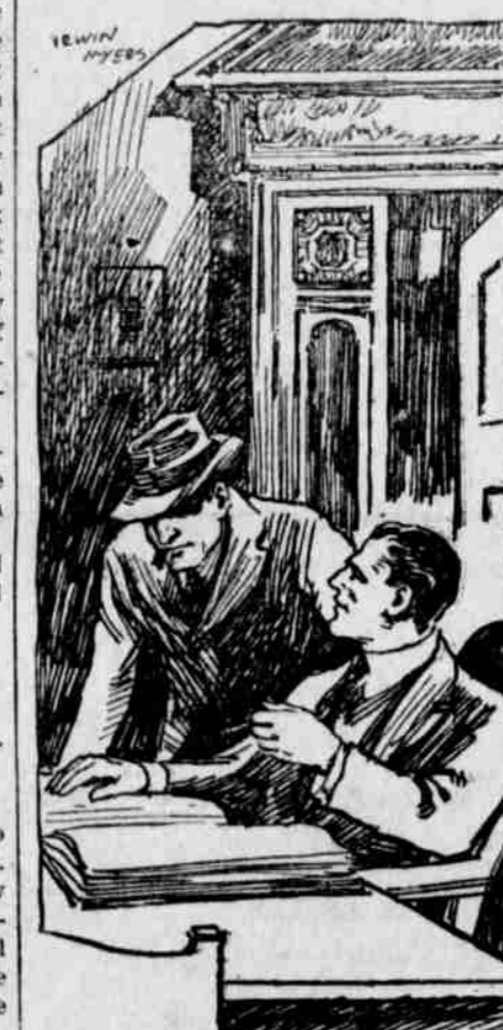
"What's He Getting Four Payments of a Thousand Pounds For?"

"Your English police know most things," he drawled, "but you've sort of got some peculiar laws in your country. With us, if we don't like a