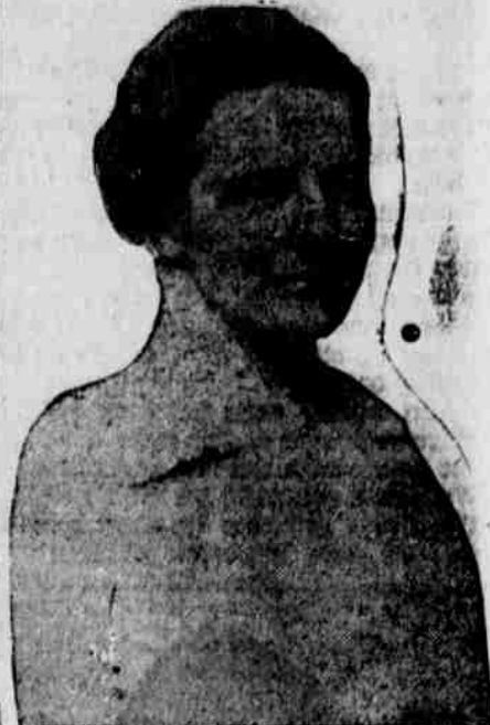
MRS. EDITH KERMIT ROOSEVELT.

Oyster Bay, N. Y.—Mrs. Edith Kermit Roosevelt, widow of Colonel Theodore Roosevelt, is evincing keen interest in the Republican campaign. She recently gave to the press the following statement urging the election of Harding and Coolidge: "The country's vital need is the election of the Republican candidates.