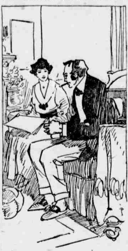
"I Should Be Placed in Charge of a Keeper."

"That quarter-section is not in the market, Colonel. When it is, I'll send for you, since you're the only logical prospect should my client decide to sell. And remembering how you butted in on politics in this county last fall and provided a slush fund to beat me and place a crook on the Superior court bench, in order to give you an edge in the many suits you are always filing or having filed against you, I rise to remark that you have about