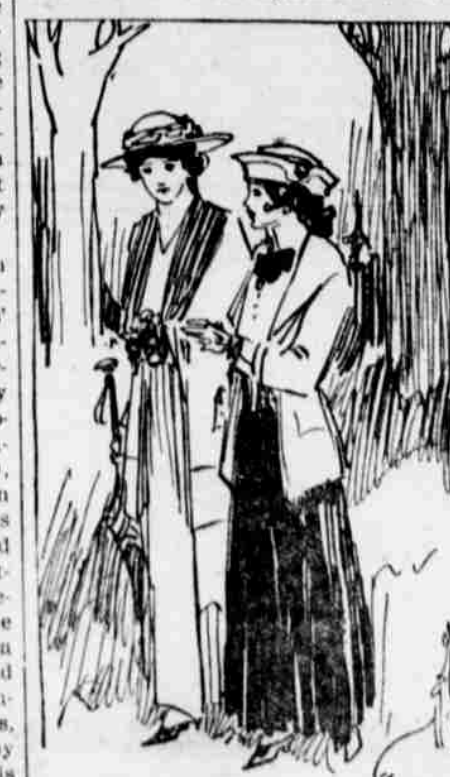
Moira Described Bryce in Minute Detail.

Moira laid her head on Shirley's shoulder and sobbed for several minutes. Then, "It's Mr. Bryce," she wailed. "He's so unhappy. Something's happened; they're going to sell Cardigan's redwoods; and they—don't want to. Just before I left the office, Mr. Bryce came in—and stood a moment looking—at me—so tragically I—I asked him what had happened. Then he patted my cheek—oh, I know I'm just one of his responsibilities—and said, 'Poor Moira! Never any luck!' and went into his—private office. I waited a little, and then I went in, too; and—oh, Miss Sumner, he had his head down on his desk, and when I touched his head, he reached up and took my hand and held it—and laid his cheek against it a little