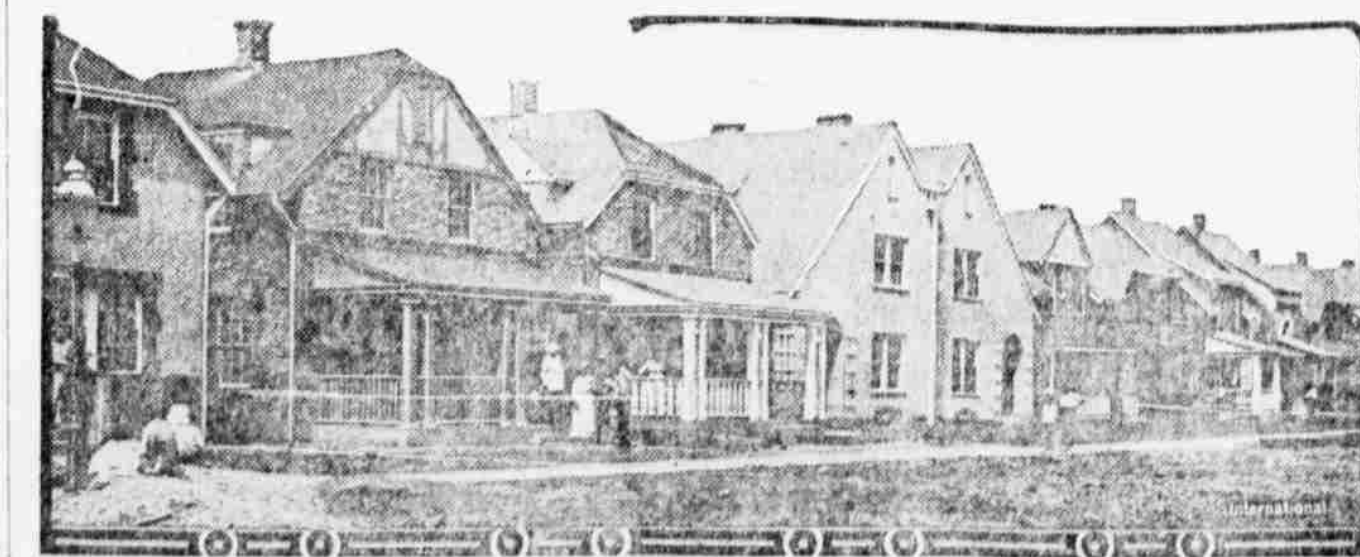
The Chicago Housing association has undertaken a great social experiment in the erection of many homes for families which had nowhere to live owing to the house shortage in that city. The homes are of brick, two stories, and the tenants pay rents of about $25 a month which is applied on the purchase price. The house is sold at exact cost.