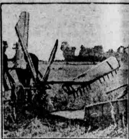
Reaper Used in Cutting Soy Beans.

The mowing machine is also used to a considerable extent in saving the soy-bean crop. Generally where this implement is used it is advisable to have a side-delivery attachment, in order that the horses will not trample on the swath of cut beans. However,