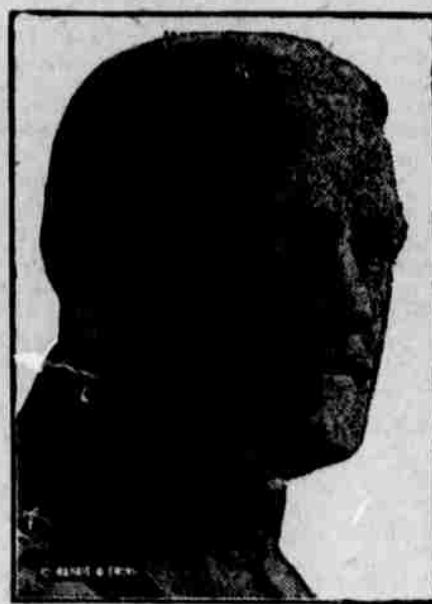
JOHN J. PERSHING for PRESIDENT