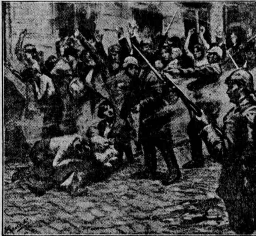
"And Then Those Germans Came."

The case of Ypres is particularly interesting. It had been proposed at one time to preserve the ruins of the whole town in their present state as a war memorial. But the interest of private owners and the attachment of inhab-