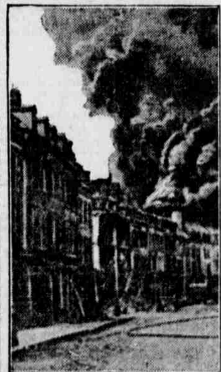
Antwerp Was in Flames.

The Belgian government has enacted a law prohibiting the manufacture, sale or keeping in stock of matches containing white phosphorus. The law provides for the confiscation and destruction of the prohibited products, as well as of the apparatus used in their manufacture.