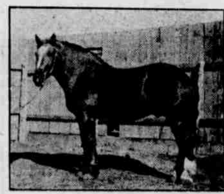
First Prize Winning Stallion WALLACE No. 121599