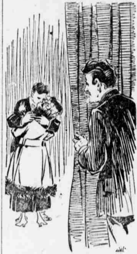
Their Lips Clung in a Kiss.

"No," he soliloquized, "this guy isn't Cupid. Cupid never wore no pin-