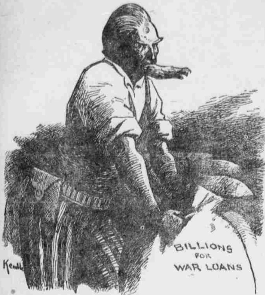
ONE MAN'S REASON WHY.

I have a son two years old. I want him to be a sportsman. I want him to be able to win like a gentleman, to lose like a man. I want him to grow up in a world where a victory gained by foul tactics is incomprehensible. I want him to feel always that his word is sacred; that no advantage to himself or others justifies the violation of his oath. I want him to reverence the memory of his mother, to look upon all women with clean eyes. I want him to grant, as a matter of fact, the demands of weakness upon strength. I want him to look upon human beings as individuals, to accept cheerfully another's right to a belief contrary to his own. I want him to gain his own beliefs through searching his own soul, not by blindly accepting the dicta of others. I want him to believe in a generous God, a God Who is a Gentleman, not a demoniac God who plays favorites. One judges a man by his professed beliefs, by his acknowledged deeds. One judges a race in the same manner. By their professed beliefs, by their acknowledged deeds, I judge the Germans. And I firmly believe that a world ruled by them would be a world in which it would be impossible for my son to grow up to be the man I want him to be.