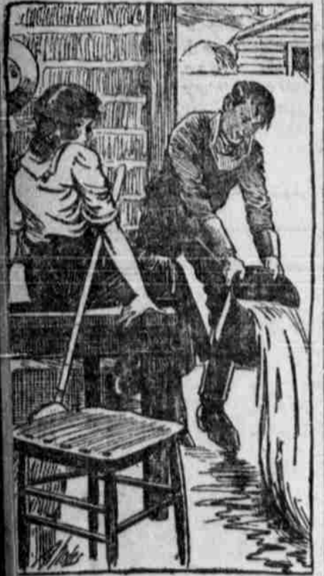
Caught Up a Pail of Water and Sloshed It on the Floor.

Billy Louise tucked her feet farther under her skirts and continued to stare dumbly. Ward, glancing at her from the corner of his eyes, stepped consid-