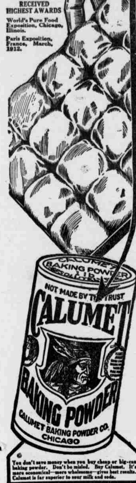
W. N. U., SIOUX CITY, NO. 18-1915.

You never tasted daintier, lighter, fluffier biscuits than those baked with Calumet. They're always good—delicious. For Calumet insures perfect baking.