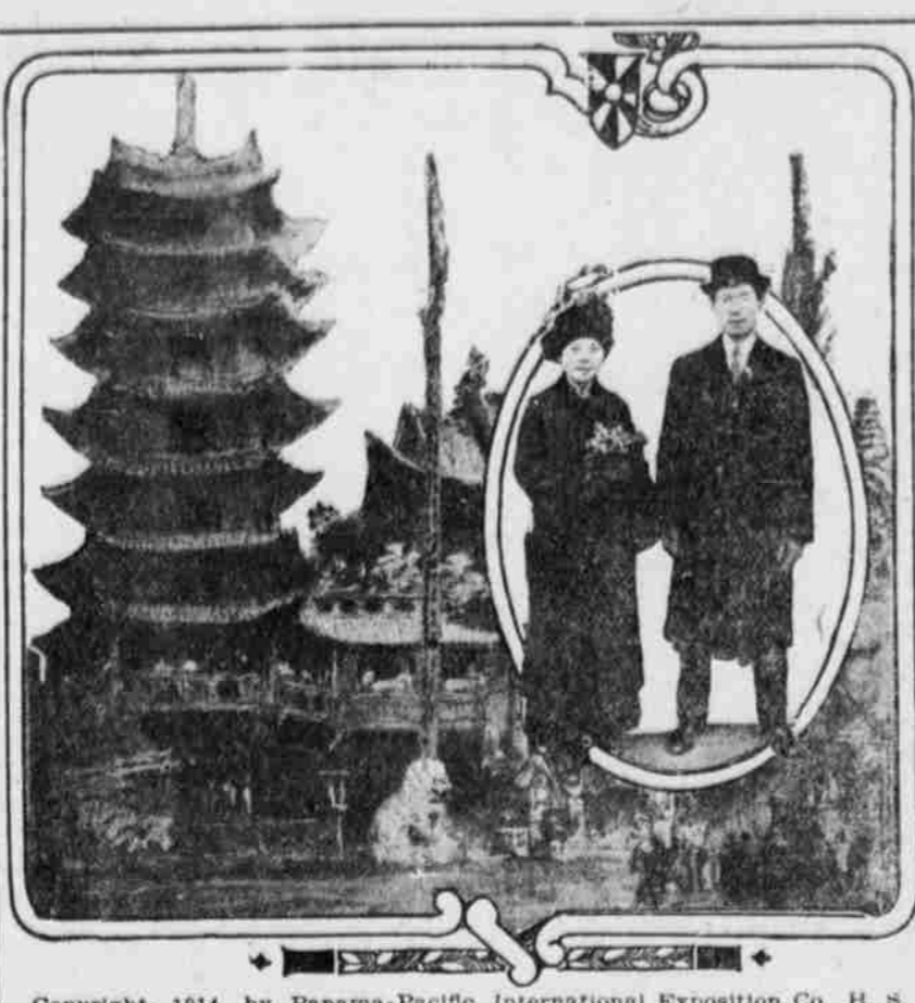
CHINA TO SPEND $800,000 IN MARVELOUS DISPLAY AT THE PANAMA-PACIFIC EXPOSITION.

SEED OATS AND SEED CORN. SEED OATS: Hatch's New Alberta, Canada Crown, Biggen, Hevora, Yielding Oats Known as Crown.