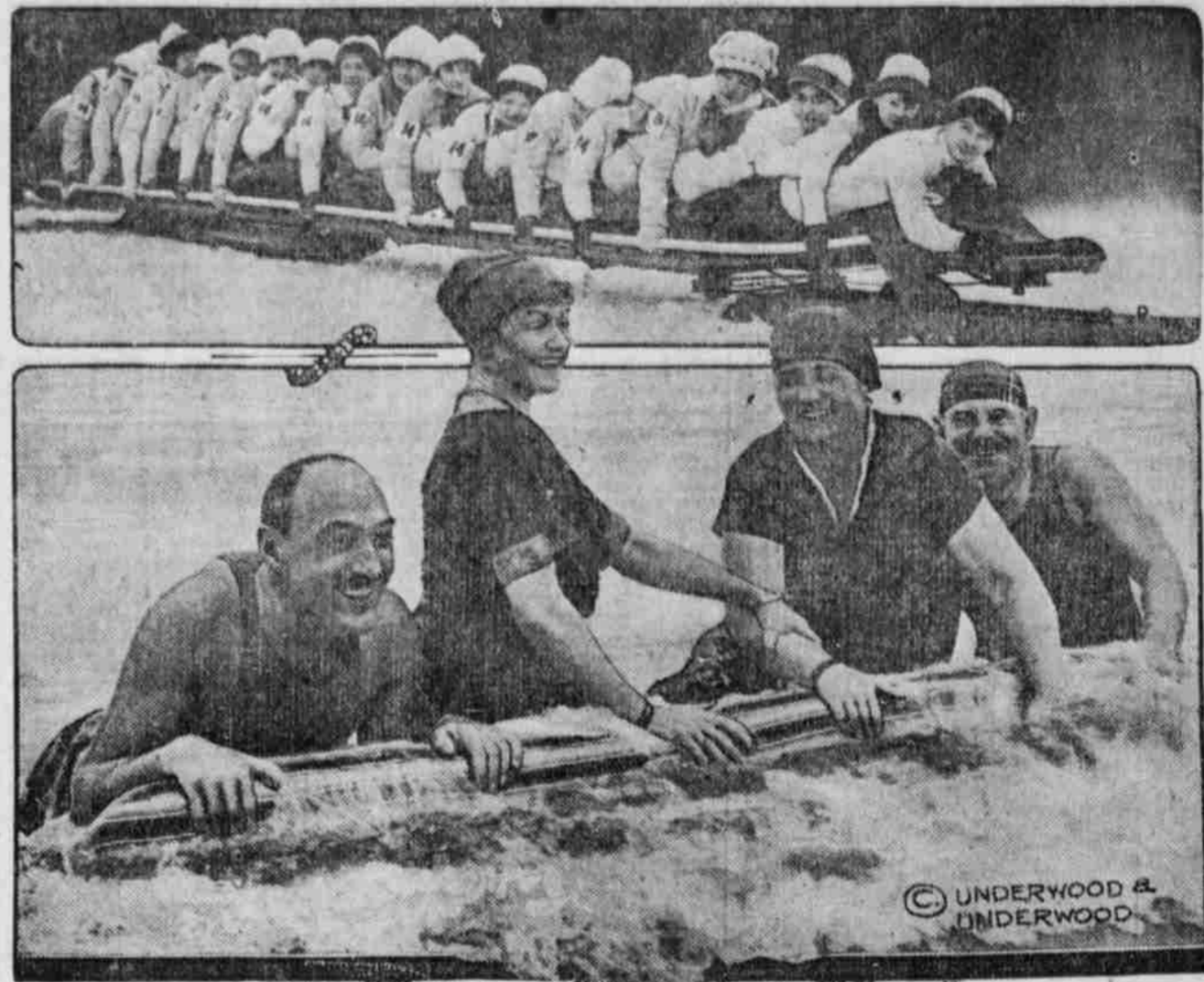
These contrasted photographs show, above, one of the crews in the annual bobsled race that attracts Long Island society folk to Huntington each February, and, below, four happy bathers at Palm Beach, Fla., on one of the floating mattresses that the folk there are using in the surf.