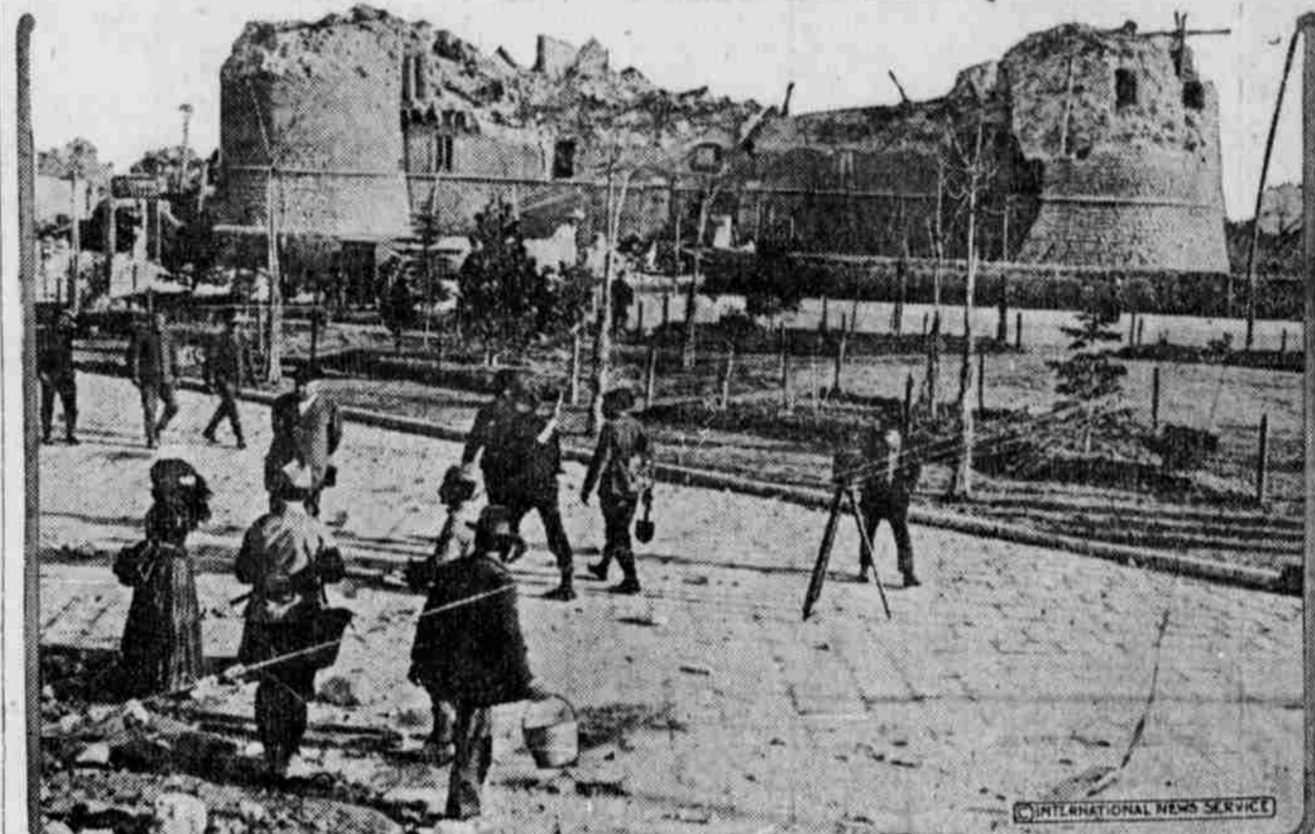
All that was left of the famous Torlonia castle at Avezzano after its massive walls had been shaken down by the recent earthquake in Italy. It was built in 1490.