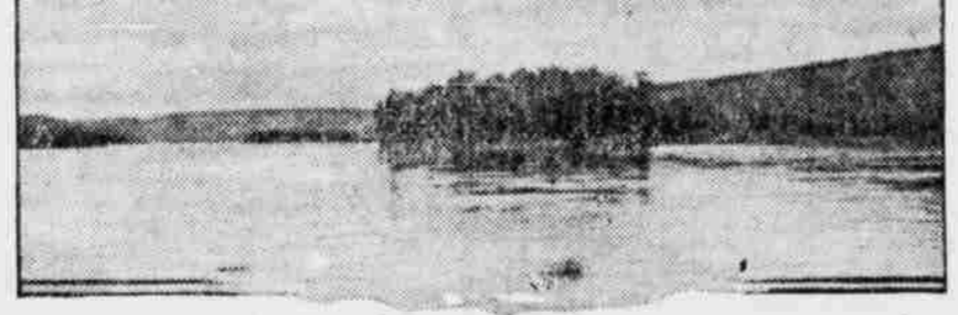
ONE OF THE MANY ISLANDS OF THE PEACE RIVER

pected to pull out before 7 and did not, we moved downstream.