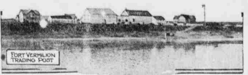
FORT VERMILION TRADING POST

THE PEACE river was first brought to the notice of the world by Alexander Mackenzie. Not satisfied with following to the Arctic ocean the river which bears his name, he went up the Peace river, crossed the Rocky mountains and made his way to the Pacific ocean, which he reached in September, 1793.