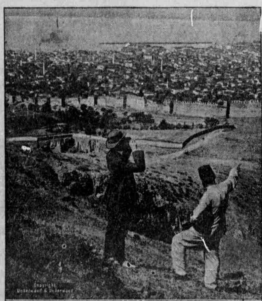
GENERAL VIEW OF SALONIKI

That being the case, not only has been hampered, but the adjoining grass. Privacy, so much to be destates, Servia and Austria in particular, have found it necessary to demand a free outlet at that port. sought shelter from Macedonia, Meeting after meeting has been held and urgent requests have been made by the citizens of Saloniki to the Then followed the flight of the Athenian government to find some Turkish population from Macedonia way of preventing the commercial and Novi-Pajaar district. In one death of the city, but thus far in vain. week some 10,000 Moslems passed The sugar and flour industry, the through Sofia station on their way shoe factories and nearly the entire to Asia. All were natives of Novi- manufacturing system have been al-Pajaar. The Turkish government re- most destroyed. Business transac-