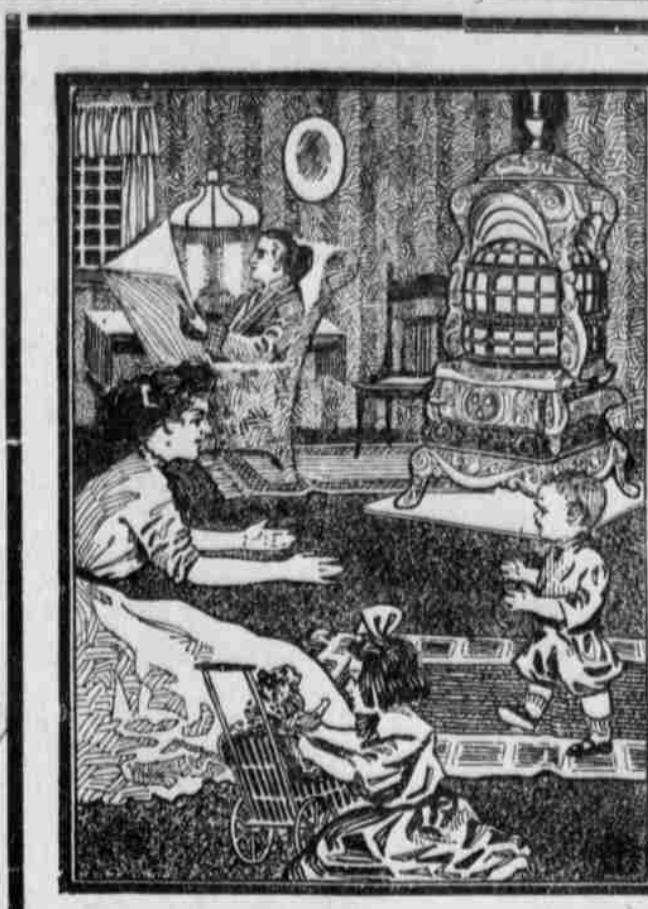
Home Made Cozy and Comfortable in Bleakest, Coldest Winter Day

There will be preaching at the Salem English Lutheran church next Sunday at 2:30 p m, and every other Sunday thereafter until further notice.