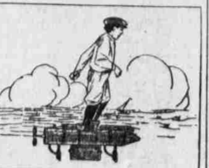
Shoes for Walking on Water.

With one of these floats, recently patented by a German inventor and which are shown in the illustration, on each foot, a man is supposed to be able to walk upon water. Each float is built of a series of hoops connected by hinged rods so that the entire frame is collapsible. A ballast tank beneath the foot keeps the float right side up and affords stability. The floats are driven by screw propellers.