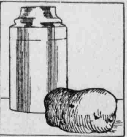
Potato Smear with Glycerine is Greatest of Germ Traps.

If there are a myriad of vegetating microbes in this 15 drops, known or