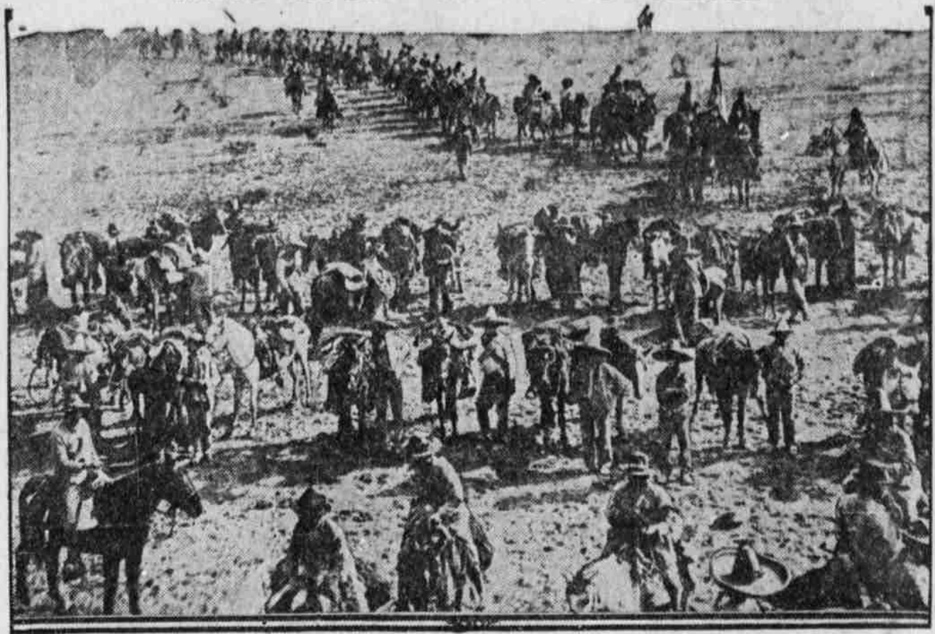
General Villa's cavalry photographed outside Torreon as they were starting in pursuit of the survivors of the Federal garrison after the capture of that city.