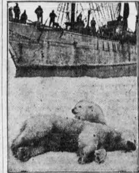
Principle of Prince's Proves. A number of polar bears were captured alive and brought home on the duke's yacht...

Paris.—Just recently Prince Louis Philippe, better known perhaps as the duke of Orleans, the pretender to the French throne, returned from the arctic regions, where this photograph was made during a successful hunting expedition through the birthplace of the