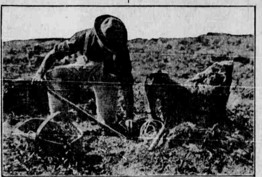
Getting Things Ready

When the Creek or Muskogee Indians adopted into their tribe the remnants of other tribes which were nearly extinct many superstitions Tuckabatches brought with them seven plates, the origin and object of work occupies herself throughout the which have puzzled scientific men year in visiting and remapping the for centuries. The Tuckabatches her aid. She is a sort of a traveling not to be handled by all persons, only