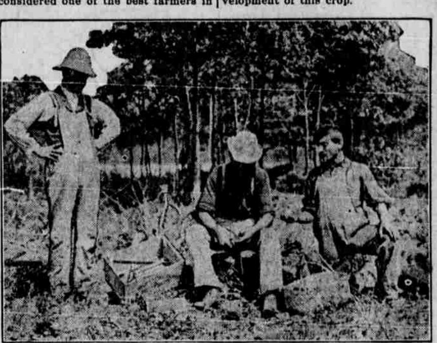
Removing With Dynamite Some of the Largest Roots.

noon, a basket lunch is served by the on which these crops were grown. ladies of the county in which the gathwhich have been practiced in the de-