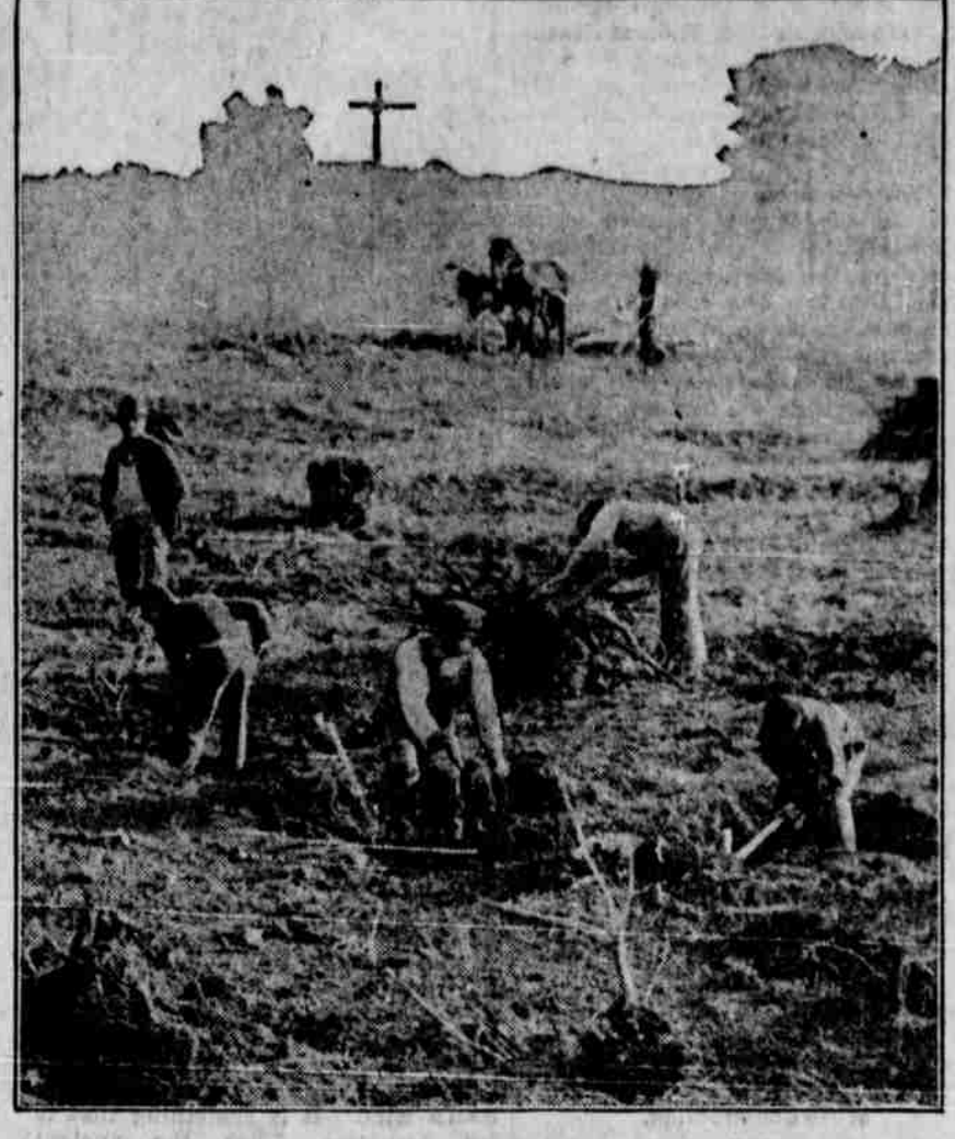
Preparing the Ground by Taking Out All the Old Roots.

whose farm was not paying very well and an agricultural expert came along and said: "Let me show you how you can double and triple your present income;" if the man looked sane and intelligent, you would doubtless jump at the chance.