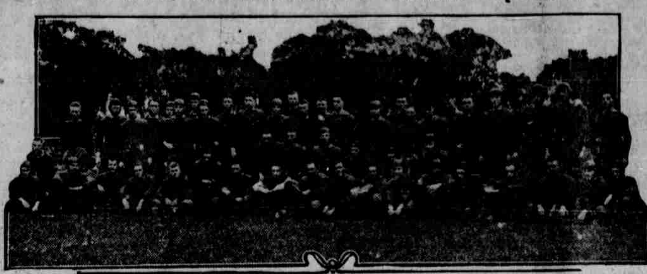
Before the largest crowd ever as sembled in America to witness a football game, these young men from the Naval academy will meet the West Point cadets at the Polo grounds, New York

HUNDREDS HURT WHEN CARS PLUNGE DOWN BANK.