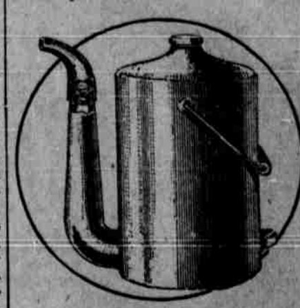
Non-Explosive Oll Can.

It is a well-known principle, and one commonly used in miners' lan that a flame cannot pass through wire gauze or netting to ignite gas on the other side. This principle has been adopted for the use of oil cans in which highly inflammable and easily volatilized liquids are carried. In the spout of the can is fitted a wire screen and above this is a disk valve that closes by gravity. Normally, the valve cuts off the contents of the can from contact with the outside atmosphere. When the can is picked up, the liquid flows freely through the screen and through the valve. Not only does the screen prevent a flame from entering