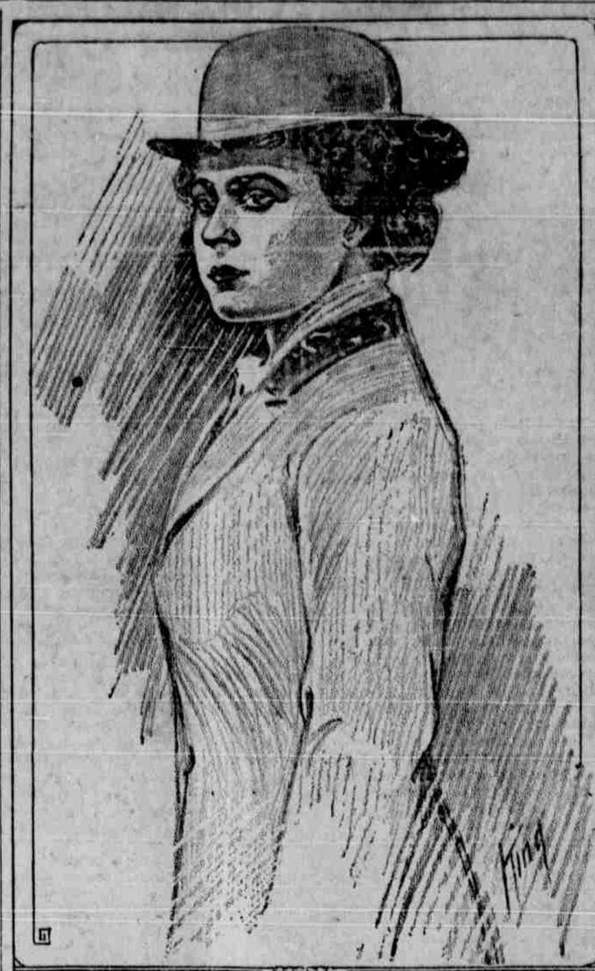
Princess Sophia of Saxe-Weimar, Who Recently Committed Suicide.

Strangely enough, the poor owners seem unable to prevent the outrage, although they angrily drive away all other birds that come near their castle.