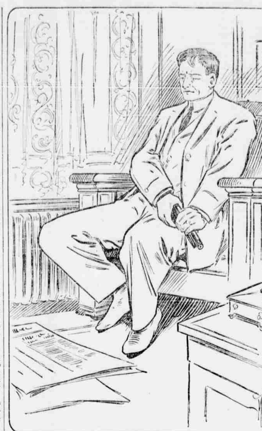
For a While Murder Ate at His Heart.

"Didn't I, though!" he proclaimed, jubilantly. "And didn't we fool 'em! I was teetotally surprised. I never dreamed they would be that easy. And now," he went on, not permitting the pause to grow awkward, "we all might as well have an accounting. I'm pullin' West this afternoon on that blamed 'Twentieth Century.' He tugged at his grip, got it open, and dipped into it with both his hands. "But don't forget, boys, when you-all want me in horseable Wall Street another flutter, all you-all have to do is whisper the word. I'll sure be right there with the goods."