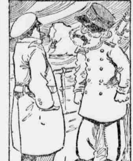
Passenger (nervously) — Captain, what would be the result if this boat should strike an iceberg? Captain—It would probably shiver its timbers.