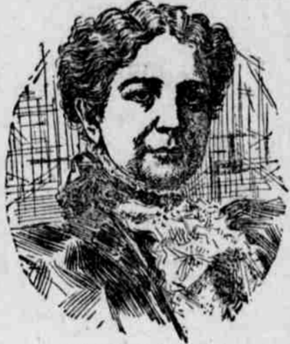
IDA SAXTON MCKINLEY.

Mrs. William McKinley has gone to join "the Major," for even after her distinguished husband became President he was always "the Major" to her. Wives and daughters of public men, through their tact, their diplomacy and the clever art of politics, have often materially aided their husbands and fathers in advancing from one position to another. Kate Chase was a better manipulator of political wires than was Salmon P. Chase. Mrs.