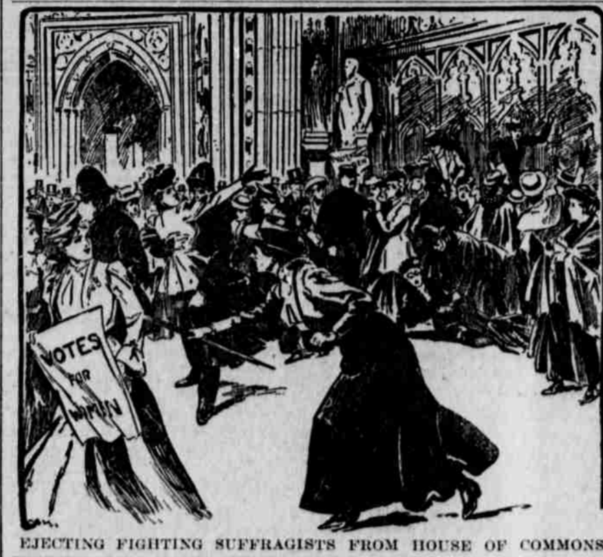
EJECTING FIGHTING SUFFRAGISTS FROM HOUSE OF COMMONS.

Buried Treasure. Piratic hoards of Spanish doubloons are not the only buried wealth one may