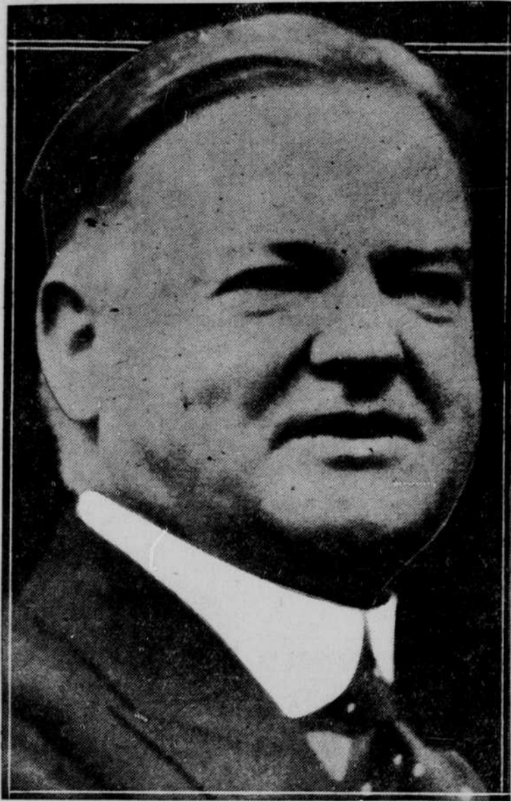
Herbert Hoover for PRESIDENT