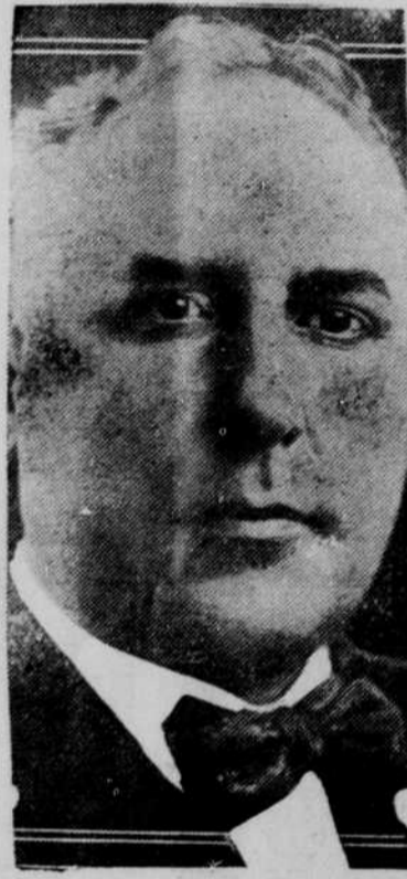
Arthur J. Weaver for GOVERNOR

The democrats are making claims that they can satisfy everybody. That party's head in New York, its tail in Arkansas, and its body in the solid South, goes forth up and down the land claiming to be the colored man's friend; offering him equal rights and privileges, while the fundamental tenet of their doctrine is to keep forever down the Negro and assert in perpetuity the so-called "White Supremacy." The Republican Party, while acknowledging that it has done many things it ought not to have done, and left undone many things it might have done, makes no such dishonest professions, but promises and strives to do the things which bring the greatest benefits and prosperity to the nation in general and therefore