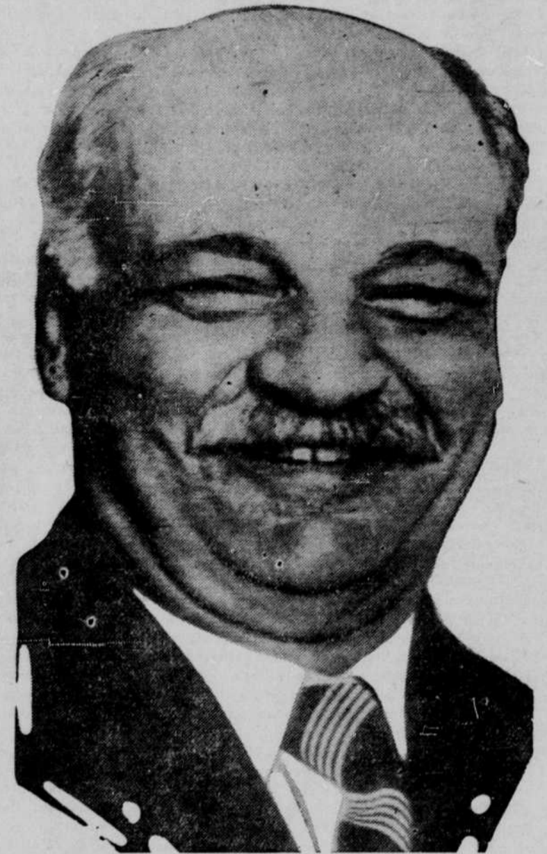
Charles Curtis for VICE-PRESIDENT