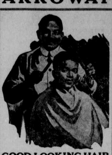
GOOD LOOKING HAIR FOR EVERY MAN