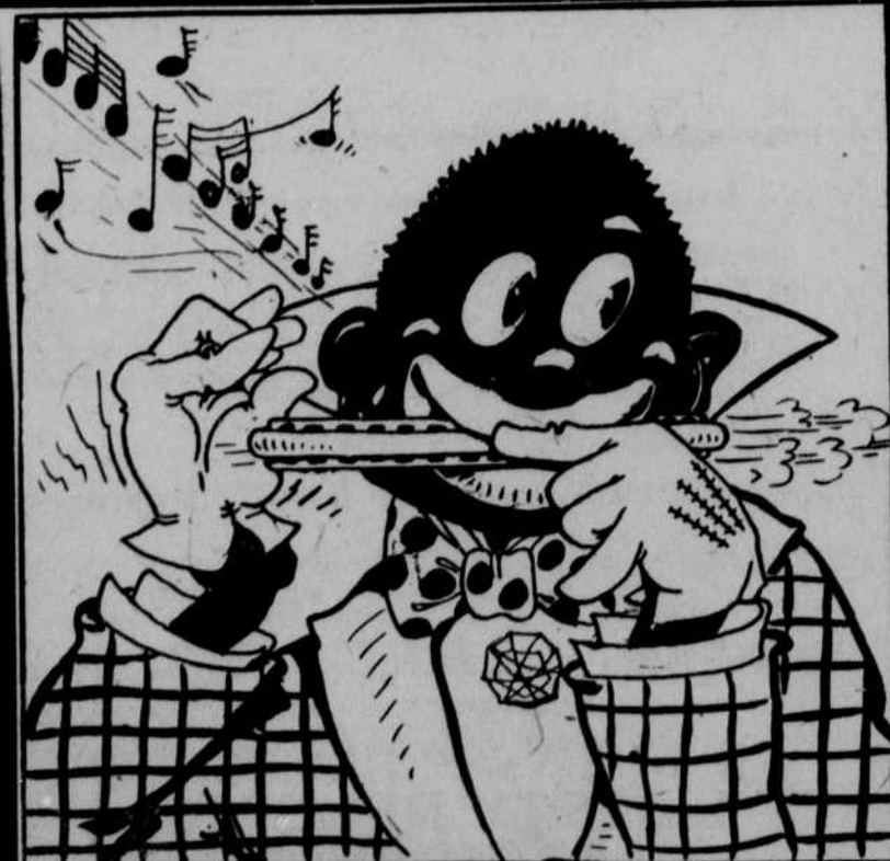
SUGAR-FOOT SNOWBALL COLORED HARMONICA PLAYING FOOL