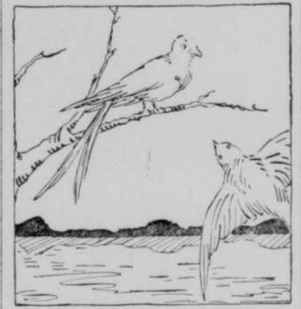
'What Do You Mean?"

"So do I," said Mr. Frigate*Bird. "I suppose it is the same way with children and with grownups," Mrs. Frigate Bird. "They probably don't care to know the family history of a cabbage for example, or a head