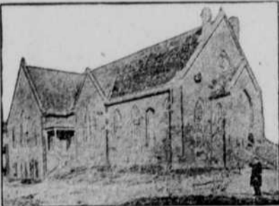
GROVE METHODIST CHURCH 22nd and Seward Sts., Omaha, Neb.