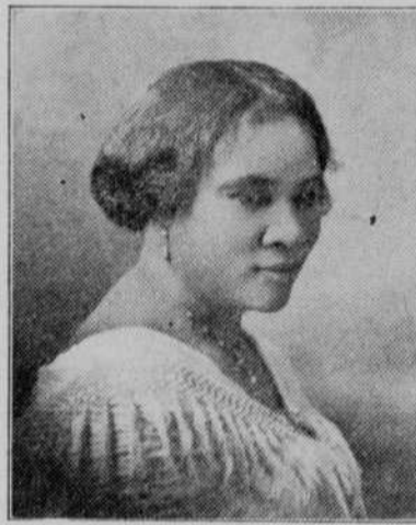
Founder of the Madam C. J. Walker Co. and Lelia College, 640 North West Street, Indianapolis, Ind.