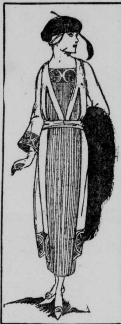
Street Frock for Stout Woman.

The style range in furs is quite as elastic as in other items of apparel. While large animal and shaped scarfs