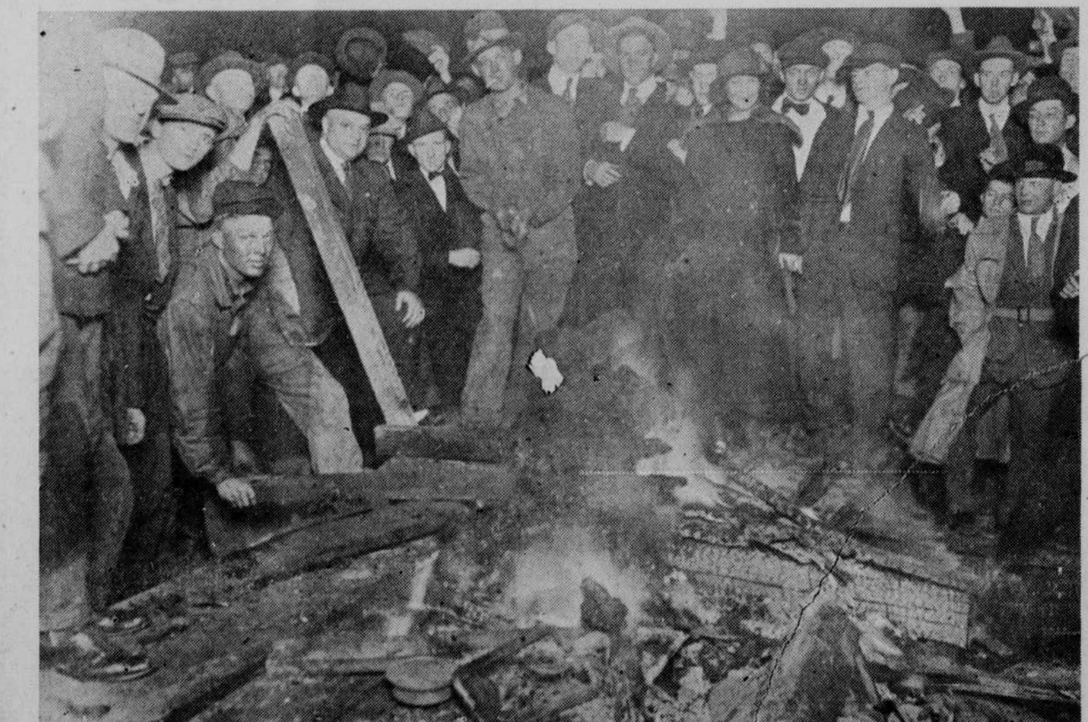
Members of Mob Burning Brown's Body at Seventeenth and Dodge Streets, Near Federal Building in Sight of Windows of Department of Justice.

UNUSUAL PANTS SHOWING A showing of all best quality of MEN'S PANTS—all fine Reading make included—for work or dress wear. Prices from $1.50 in cotton qualities up to $6.95 for all wool worsted—that sell regularly at $10 to $12. 5 to 10 P. M. Sale.