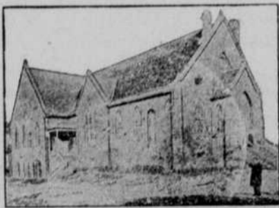
GROVE METHODIST CHURCH 22nd and Seward Sts., Omaha, Neb.

Sunday School, 10 a. m.; morning service and preaching, 11 a. m. B. Y. P. U., 6 p. m.; evening service and preaching, 8 p. m. Prayer meeting Wednesday night; Women's Missionary Society, 1st and 3d Sunday, 4 p. m.