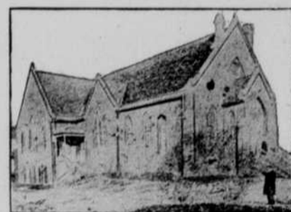
GROVE METHODIST CHURCH 22nd and Seward Sts., Omaha, Neb.