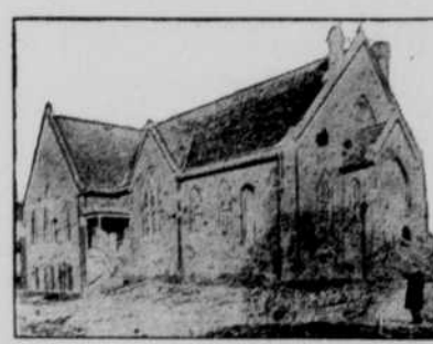
GROVE METHODIST CHURCH 22nd and Seward Sts., Omaha, Neb.

2416 Blondo St., Omaha, Neb. Telephone Webster 880