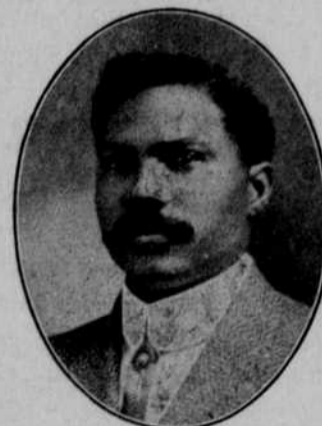
Omaha's Most Successful Barber.

Telephone Red 3357 1313 Dodge Street Omaha, Neb.