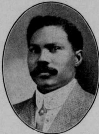
Omaha's Most Successful Barber.