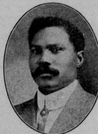
Omaha's Most Successful Barber

Webster 248 Chapel. Open Day and Night. 2518 Lake Street