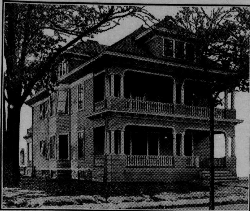
PERSPECTIVE VIEW—FROM A PHOTOGRAPH.