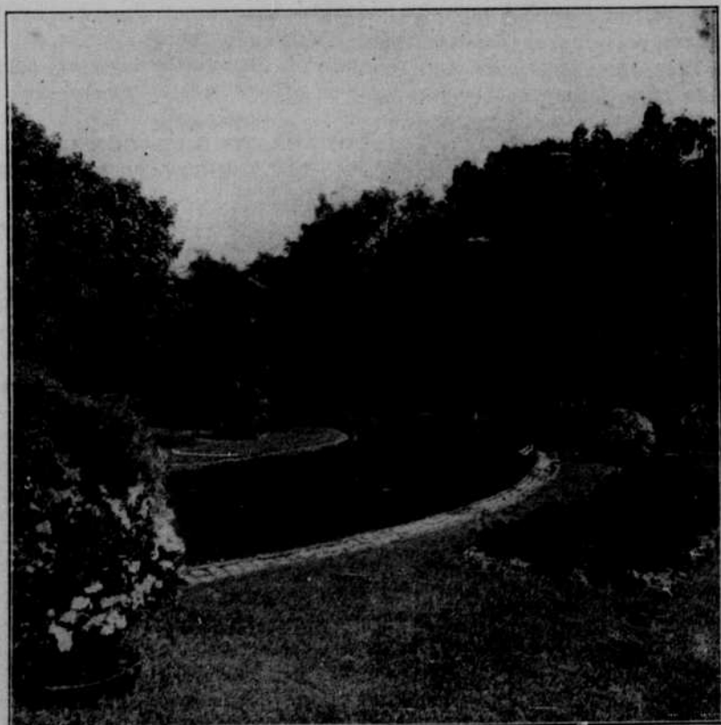
Boulevard Scene in Omaha.