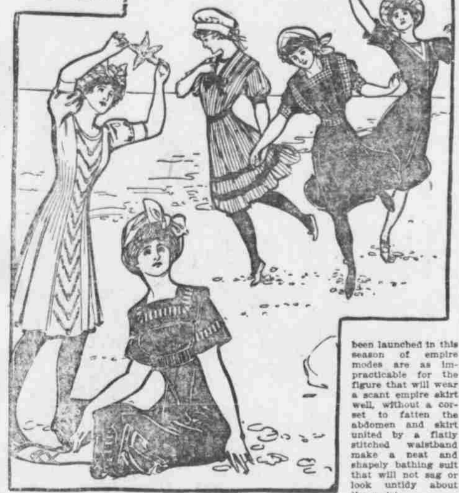
been launched in this season of empire modes are as impracticable for the figure that will wear a scant empire skirt well, without corset to fatten the abdomen and skirt united by a flatty stitched waistband make a neat and shapely bathing suit that will not sag or look untidy about the waist.

The princess models shown in the shops are impracticable save over a corseted figure, and the empire models which have