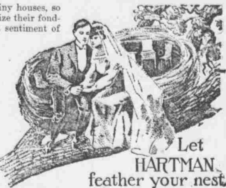
Let HARTMAN feather your nest.