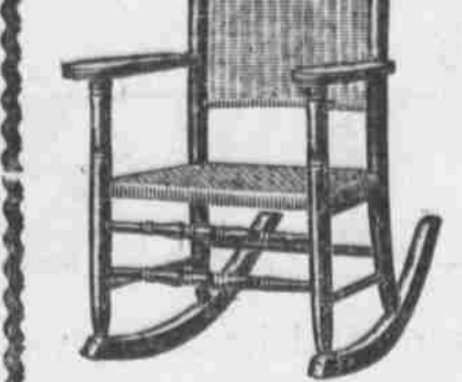
Porch Rocker, like cut, with double reed seat and back, finished light, price ... $2.65