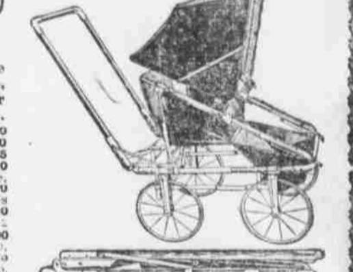
ALL-WEATHER FOLDING GO-CARTS

We Carry a Complete Stock of Moodj Porch Rugs in Oriental Designs—All Sizes