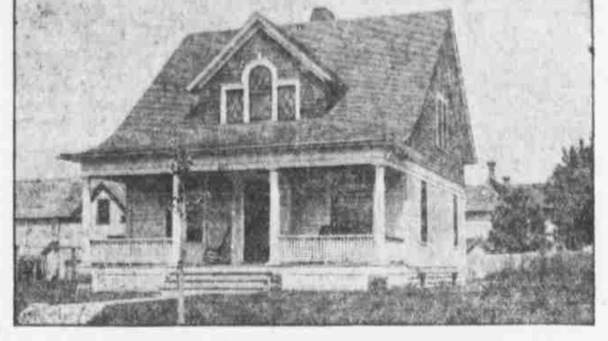
J. M. C. DESIGN, No. 1.

In this series of inexpensive homes, will you not look long and far before seeing a more pleasing exterior than shown in this issue? The roof is carried over the porch in a gentle curve and is broken by a single dormer, which is a whole bed room in itself.