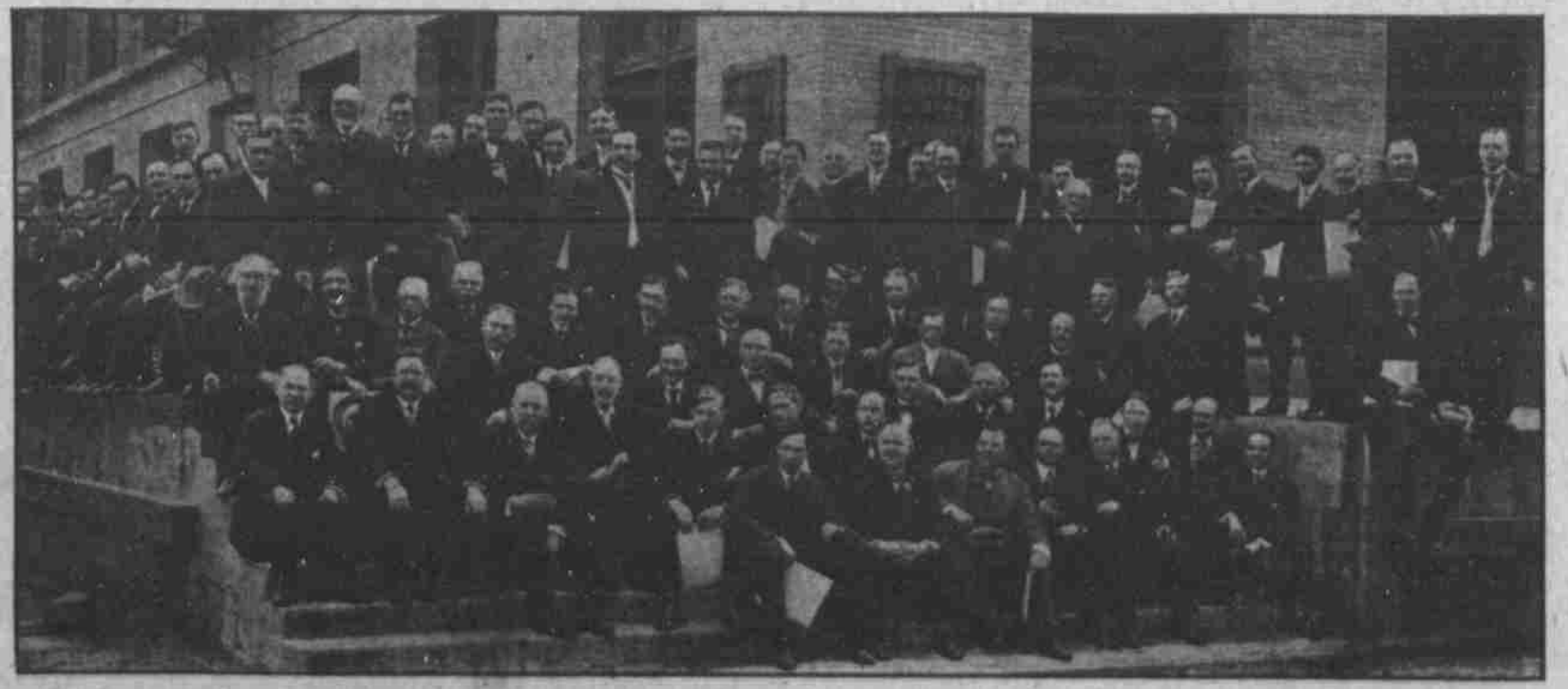
TRADE EXCURSIONISTS AT THE UNITED STATES SUPPLY COMPANY S BUILDING