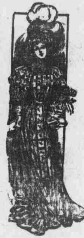
Silk and Net Waists, $1.98 to..... $25 Linen Waists, $1.50 to..... $10 3 ROUSING SPECIALS FOR MONDAY'S SALE. Women's $7.50 Covert Jackets lined or unlined, newest styles, Monday, at..... $5

Elegant New Waists , the most complete showing you'll find in Omaha. Lawn Waists, 50c to..... $20.00