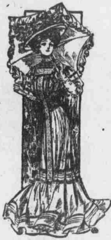
100 Panama Tailor Suits , Prince Chap styles in all colors, values to $20.00 at..... $12.50 Silk Underskirt Free to every purchaser of one of our fancy French Voile skirts, Monday, at..... $9.90