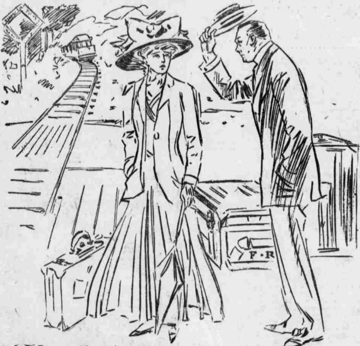
3. So Fluffy went to Silver Fall, up in the mountains high; At the station no one met her, and she felt alone and shy. When a big young man stepped forward, "Can I help you, Miss?" said he, She blushed and smiled and dimpled, "I'm the postmistress," said she.