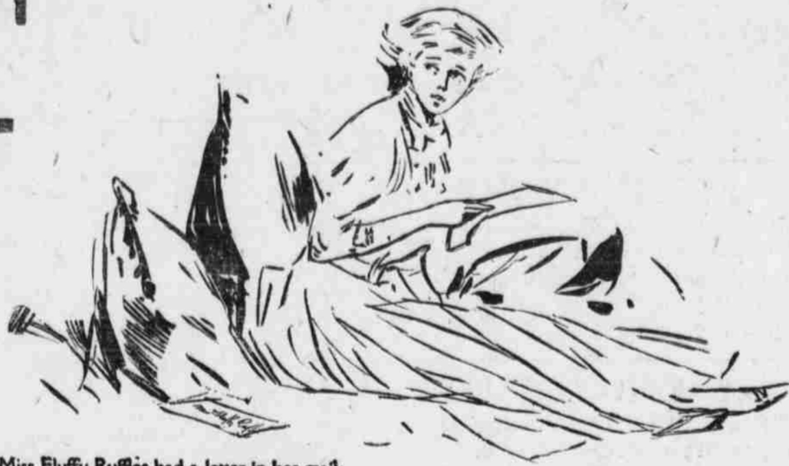
1. One day Miss Fluffy Ruffles had a letter in her mail: She read it, and she thought, "Perhaps I may as well avail Myself of this position; though the salary is small, 'Twill be a pleasant outing to go to Silver Fall."

(COPYRIGHT, 1907, BY THE NEW YORK HERALD CO.) All Rights Reserved.