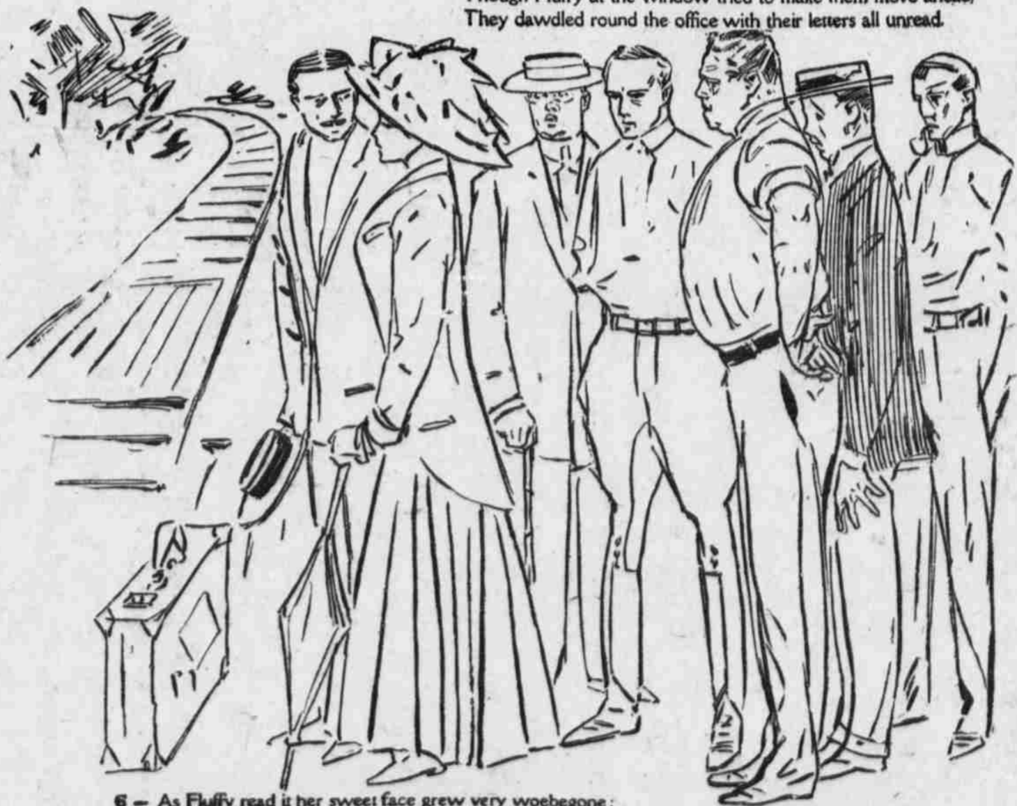
6. As Fluffy read it her sweet face grew very woebegone; "Miss Fluffy Ruffles," it began, "Dear Madam," it went on, "We are prepared your formal resignation to accept." Fluffy wrote her resignation, then she went back home and wept.