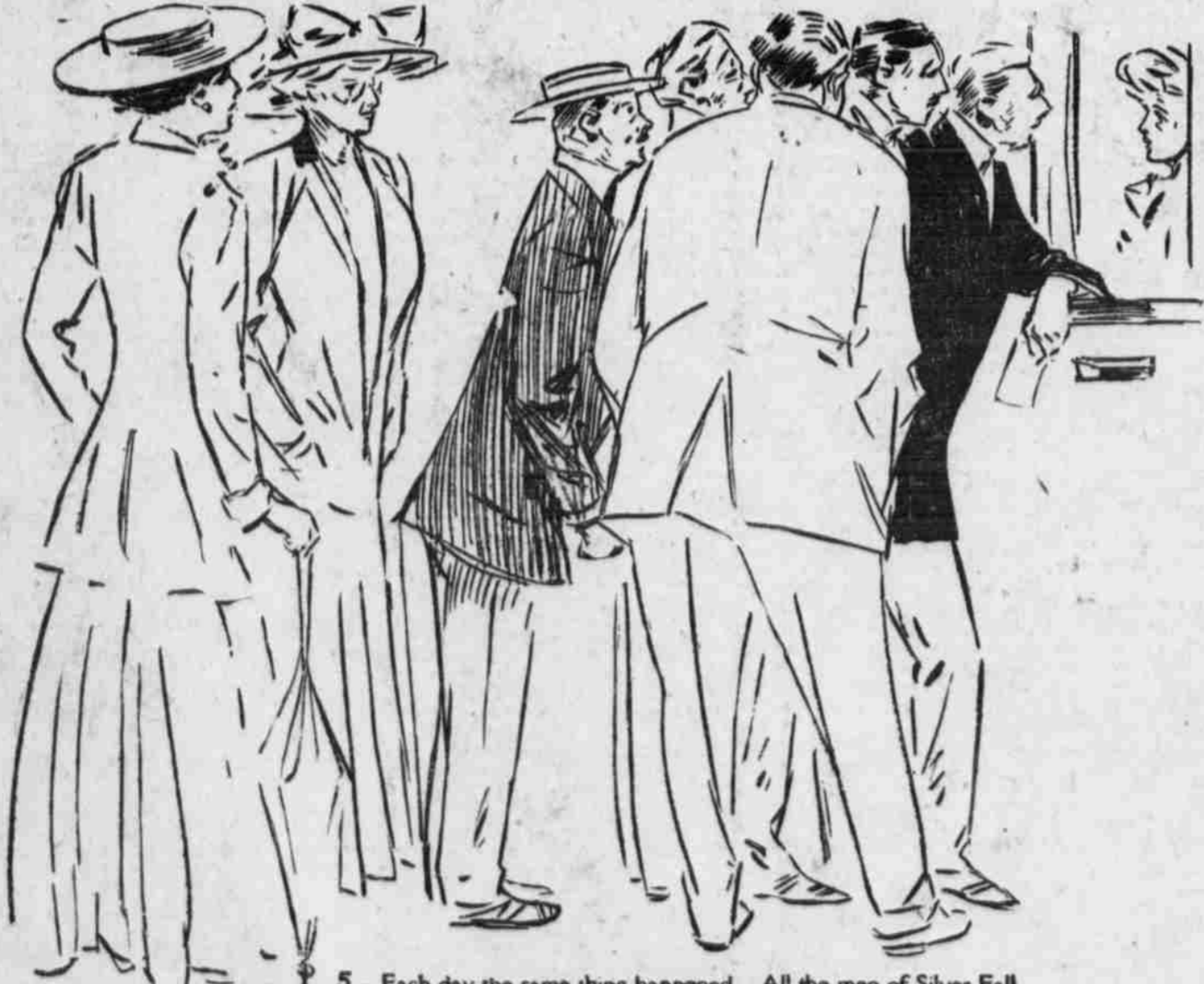
5. Each day the same thing happened. All the men of Silver Fall Filled the office, and the ladies couldn't get inside at all. Poor Fluffy tried to stop it, but though she was not to blame, One day a big official letter to Miss Ruffles came.