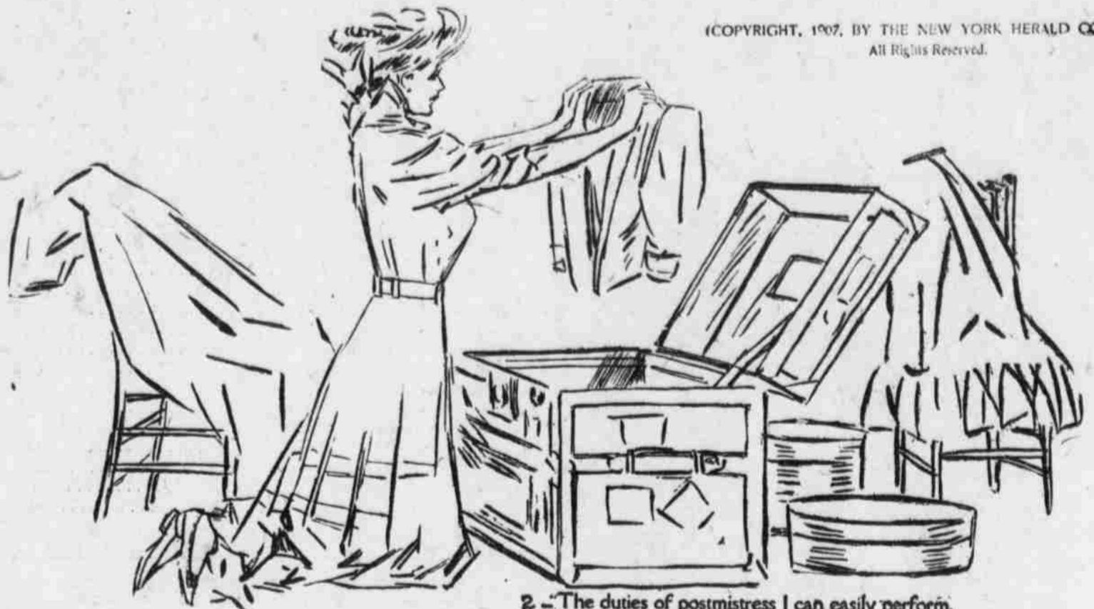
2. "The duties of postmistress I can easily perform, And the mountains will be pleasant, now the weather is so warm, I'll take my summer frocks and hats—I'll need them, I expect; It's a swaggy little settlement, exclusive and select."