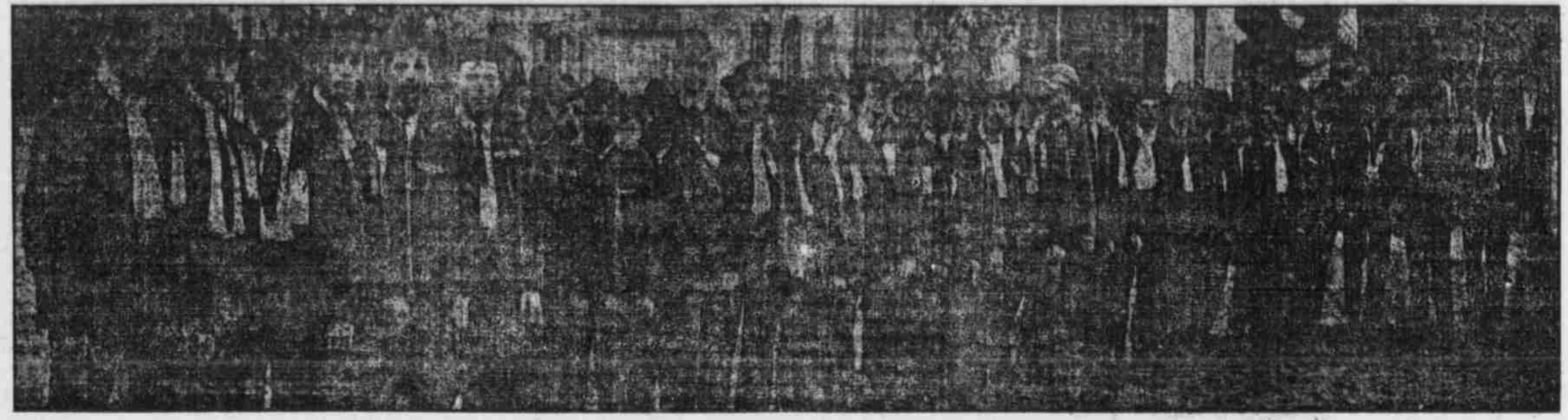
ATHLETES WHO TOOK PART IN THE BOHEMIAN TURNER COMPETITION AT SCHUYLER.