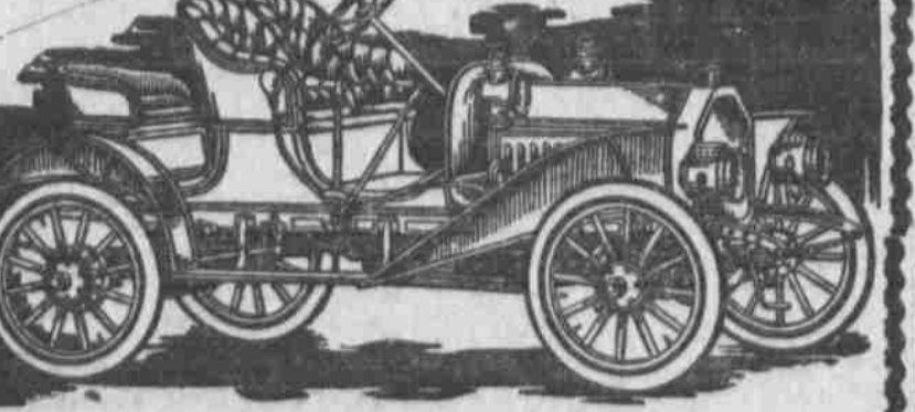
Four Cylinder, Shaft Drive, 20 H. P., $900