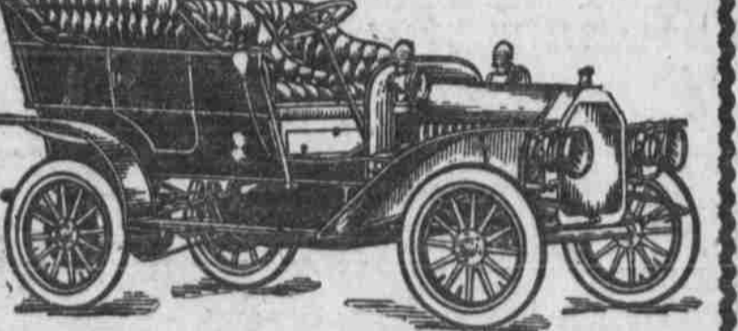
Four Cylinder, Shaft Drive, 30 H. P., $1750