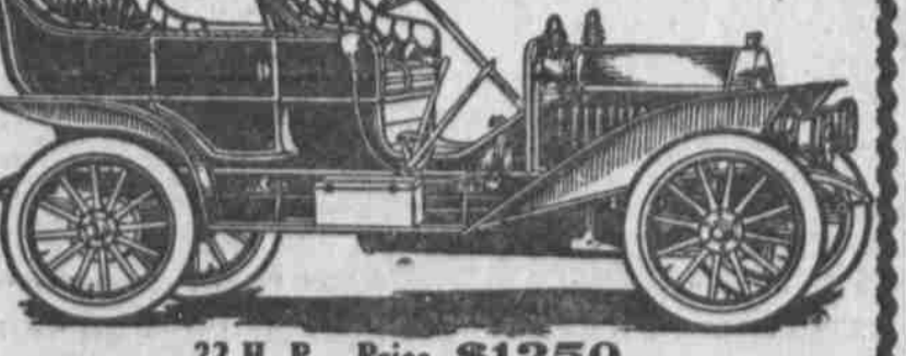
22 H. P. Price, $1250

A Guaranteed Car with a Record of 90,000 Miles SEE THE BUICK LINE AT THE SHOW Bergers Automobile Co. 2025 Farnam St. OMAHA