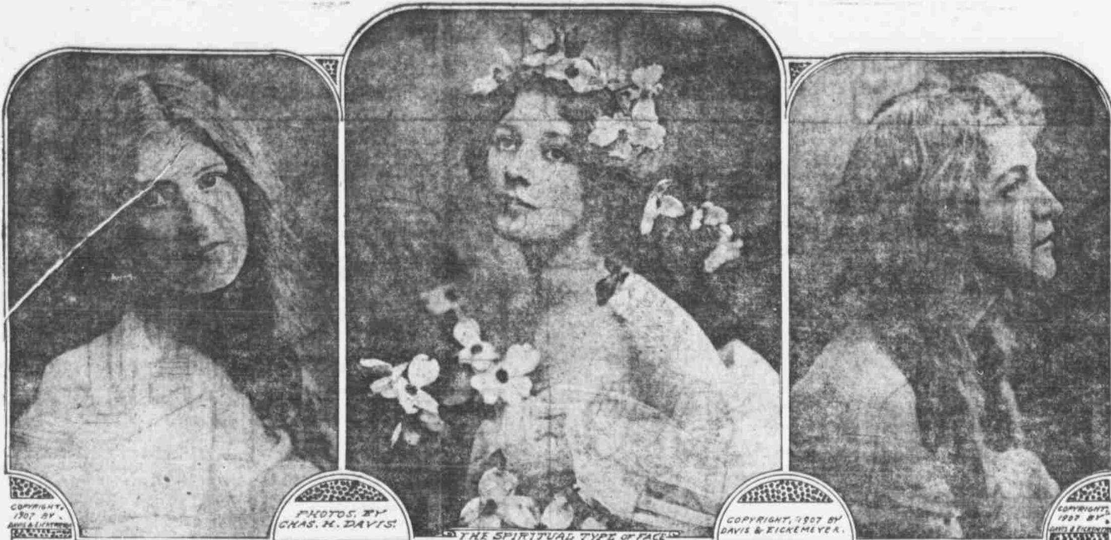
AN EVOLUTION OF THE TYPE TENDING TOWARDS THE CLASSIC. THE SPIRITUAL TYPE OF FACE. A MODEL FAVORING THE CLASSIC MOULD.

N EW YORK, Jan. 4.—What will the American girl of the future be like? Will she develop into the type composite phonographs make of her, a combination of many types, or is she harking back in her features to the old Greek standard and daily bounding more like the ideal head within the grave and accepted as a perfect reproduction of the Goddess of Liberty and put on its coins?